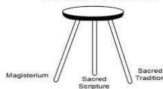
The Catholic Church

Catholics believe that the Bible's writers were inspired by the Holy Spirit, so the true author is God.