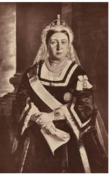
Queen Victoria- head of the British Empire 1837- 1901