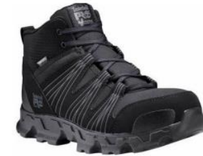
Not plain black and a hiking boot