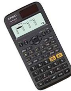
SCIENTIFIC CALCULATOR (if needed for the subject)