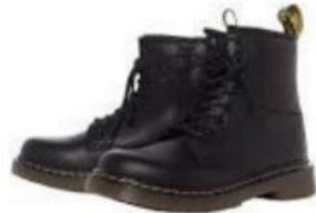
Doc Marten Boots