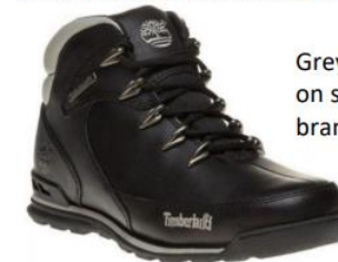
Grey/White stripe on sole and branding stitched