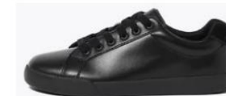
Trainer style boots