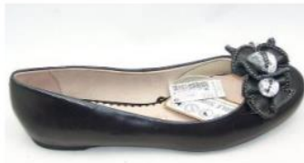
Elaborate decorative flower