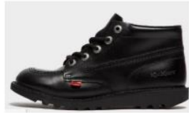
Only may be worn with trousers