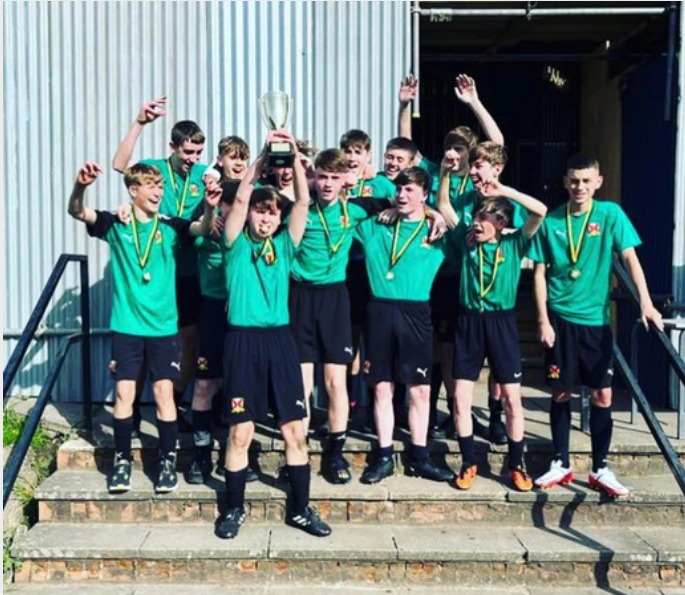
Year 10 Champions