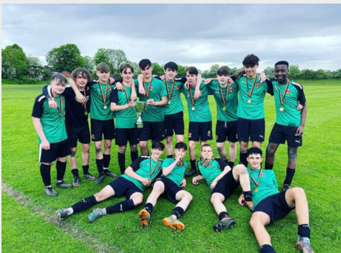
Year 11 Champions