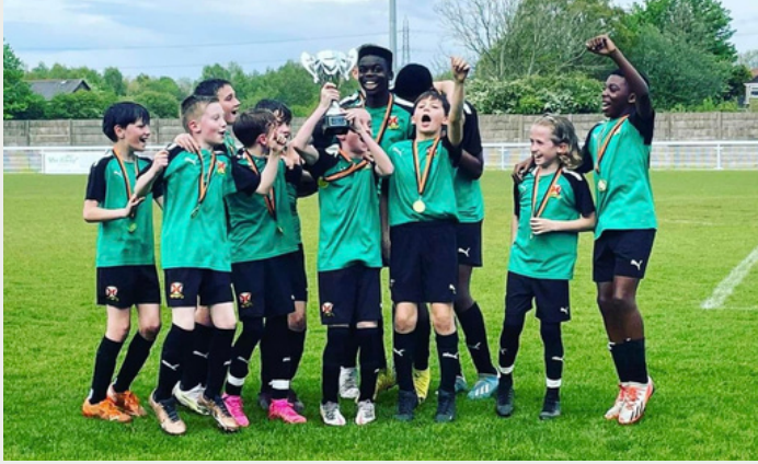
Year 7 Champions

Our St Pat's football teams completed the treble back in May! Our Year 7, Year 10 and Year 11 teams won their respective cup finals. We couldn't be prouder, well done boys!