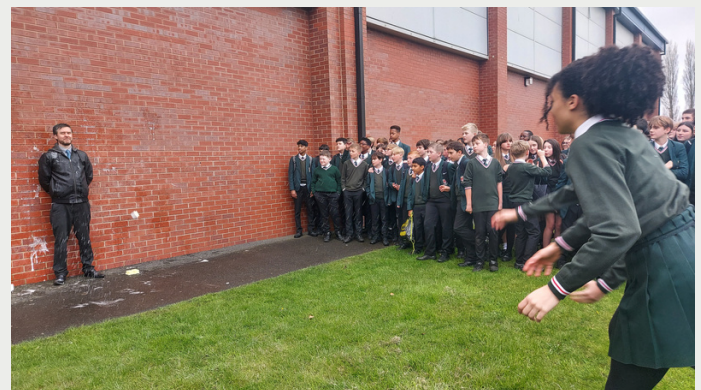
Staff vs Student Sponge throwing

With Staff vs Student events planned for later in the year, as well as a showcase event with the Drama department in the works, the Year 11s really are showing an incredible level of organisation and commitment to ensuring that this year's Prom is going to be one of the best!