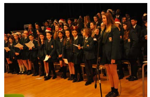
Music throughout the event was provided by the school choir and soloists.