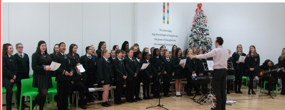
St Patrick's Choir at our Senior Citizens Christmas Party.

So, congratulations and keep up the good work."